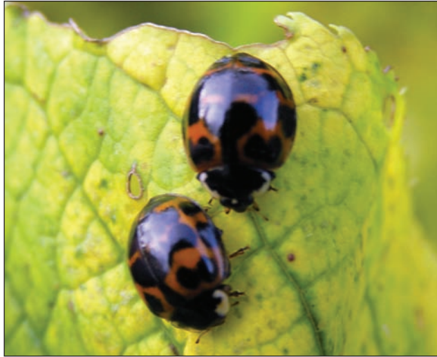
Fig. 5. Harmonia axyridis f. succinea , dark autumn colouration.

woody plants benefited the activity and development. Hundreds of adults and larvae were observed to be active until 19 December. As long as aphids were present H. axyridis fed on available food. Small larvae were encountered in November. Also, pupation took place in late autumn and adults emerging from pupae were observed throughout November. Compared to adults emerging in summer, these individuals were very dark. The dark spots on the elytra of f. succinea were enlarged, frequently merging into large dark areas (Fig. 5), and in the case of the melanic colour forms, the red spots were sometimes hardly discernible. All live pupae observed at the end of November (several thousand specimens) died during winter.