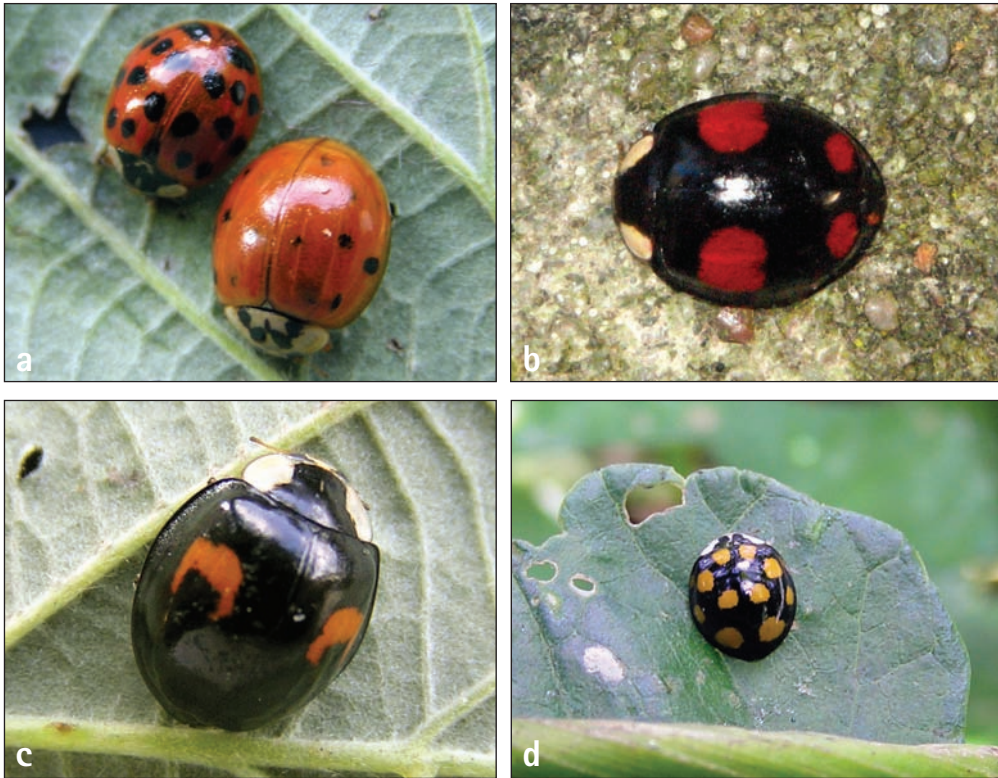
Fig. 2. Colour forms of Harmonia axyridis .

a. Forma succinea, b. Forma spectabilis, c. Forma conspicua, d. Forma axyridis.