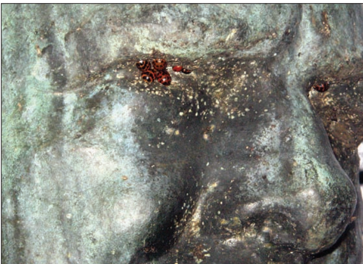
Fig. 6. Aggregation of Harmonia axyridis overwintering on statue, January 2008.

Aggregations of H. axyridis overwintering outdoors were located (in cracks and crevices of tree trunks, on iron fence posts and statues (Fig. 6), in dead leaves at the base of trees) and were observed at intervals throughout the winter. These clusters allowed easy observation of the exact time the ladybirds resumed activity in spring 2008. The first active