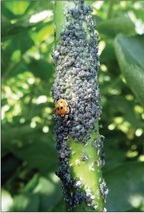
Fig. 3. Adalia decempunctata f. decempunctata. This abundantly occurring colour form of the 10-spotted ladybird is the main cause of misidentification of H. axyridis . A. decempunctata is markedly smaller than H. axyridis (3.5–5mm).