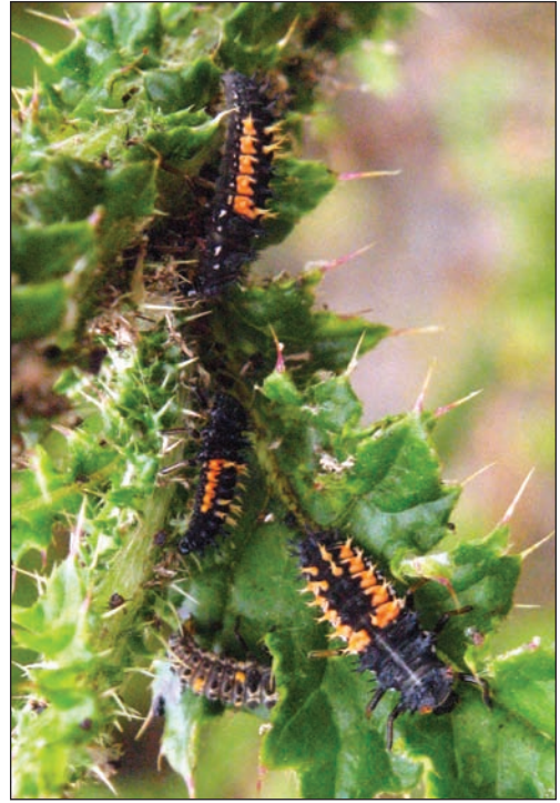
Fig. 4. Larvae of Harmonia axyridis on thistle, July 2008.

Dispersal rate. Compared to the UK, the dispersal within Denmark appears to have been rather slow. In the UK, the species has on average spread northwards 58 km per year and westwards 144.5 km per year (Brown et al. 2008b). The hotspot discovered in Copenhagen in late autumn 2007 was restricted to the central parts of the city and to adjacent neighbourhoods, with single specimens being reported from outer suburbs. From the center of Copenhagen, where large populations developed in spring 2008, the species has now spread to locations at a distance of up to only 30 km.